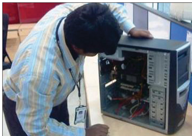
Figure 3: Hardware maintenance and periodic up gradation are keys to maintaining robust picture archiving and communication system infrastructure

Equally important is periodically scheduled preventive maintenance for both the application software as well as hardware. This includes, but is not limited to, points such as regularly clearing the viewer cache on workstations, defragmentation of workstation memory, updating antivirus definitions, and cleaning out the Windows registry [Figure 3]. PACS server preventive maintenance