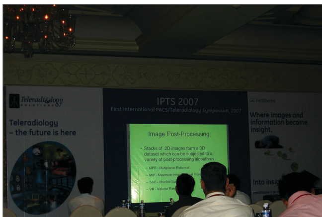
Figure 2: Training is an essential part of picture archiving and communication system implementation